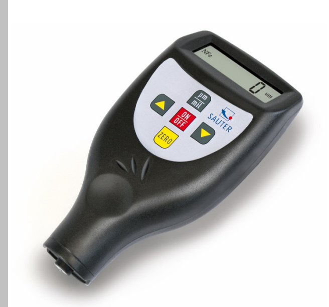
Illustration: TC 1250-0.1FN