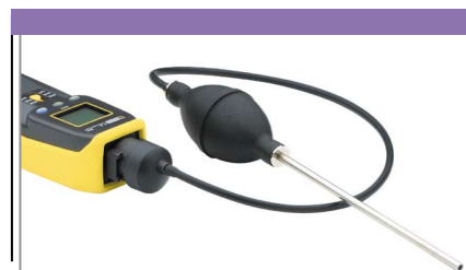
Gas extraction kit with pump and connector