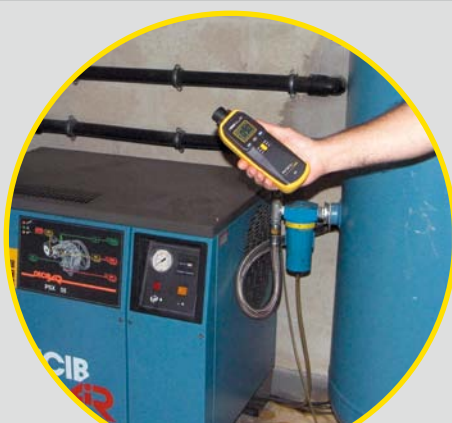
Carbon monoxide level detection