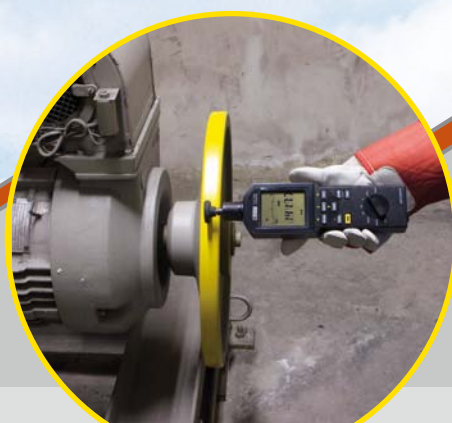
Rotation speed measurement