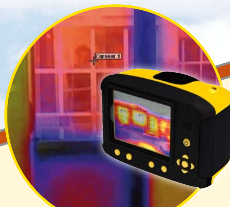
Thermal insulation inspection