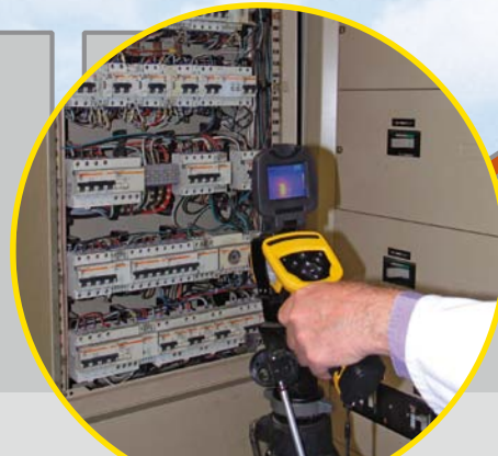
Inspection of electrical cabinets