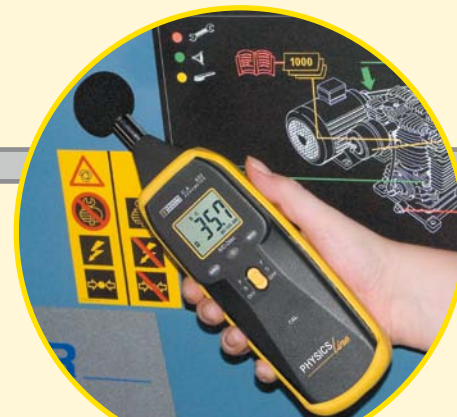
Sound level measurement