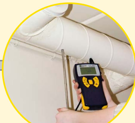
Ventilation duct inspection